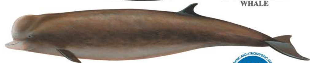
NORTHERN BOTTLENOSE WHALE

Illustrations Copyright Garth Mix • www.gmixdesigns.com