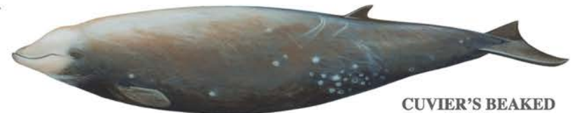
CUVIER'S BEAKED WHALE