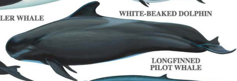
LONGFINNED PILOT WHALE