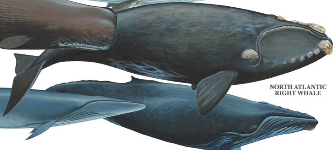
NORTH ATLANTIC RIGHT WHALE