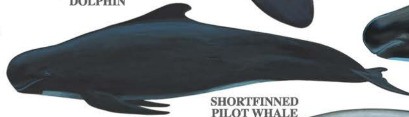
SHORTFINNED PILOT WHALE