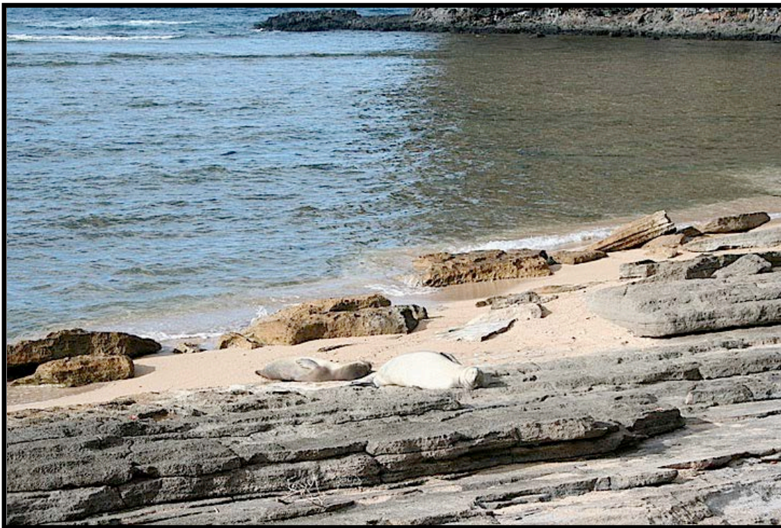
Monk seals hauled out on the beach at Nu‘alolo Kai, Nā Pali, Kaua‘i