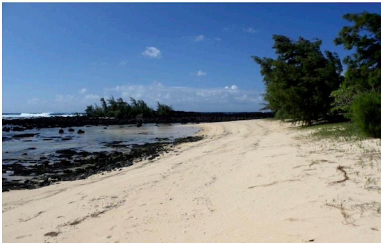
Figure 2: ‘Īliopi‘i point, Kalaupapa peninsula, Moloka‘i, a rural community that has developed a relatively conflict-free relationship with monk seals. As a result, monk seals have flourished in this area.

In a few unique places in the archipelago monk seals are regarded as a natural part of the ecosystem and human-monk seal conflicts appear to be minimal (Figure 2). These areas tend to be rural and fairly isolated communities that are characterized by a higher degree of self-sufficiency, and where familial traditions and local decision-making processes are preserved. On Ni‘ihau Island, for example, monk seals became established nearly three decades ago. Community members discussed the social impacts associated with monk seal colonization (e.g, increased presence of sharks), and ultimately decided to act as stewards of the animals (Robinson, 2008). As a result, a sub-population has become established and residents have developed a stewardship ethic towards the species. A similar situation is occurring in the isolated Kalaupapa community on Moloka‘i Island, where another sub-population is thriving in the MHI, and where community residents largely leave seals alone. In these communities, fishers and other ocean users will move away from areas where seals are visible in order to minimize interactions.