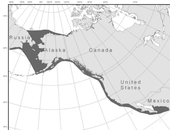
Figure 35. Approximate distribution of the Eastern North Pacific stock of gray whales (shaded area).

Gray whales formerly occurred in the North Atlantic Ocean (Fraser 1970, Mead and Mitchell 1984), but this species is currently found only in the North Pacific (Rice et al. 1984, Swartz et al. 2006). The following information was considered in classifying stock structure of gray whales based on the phylogeographic approach of Dizon et al. (1992): 1) Distributional data: two isolated geographic distributions in the North Pacific Ocean; 2) Population response data: the eastern North Pacific population has increased, and no evident increase in the western North Pacific; 3) Phenotypic data: unknown; and 4) Genotypic data: unknown. Based on this limited information, two stocks have been recognized in the North Pacific: the Eastern North Pacific stock, which lives along the west coast of North America (Fig. 35), and the Western North Pacific or "Korean" stock, which lives along the coast of eastern Asia (Rice 1981, Rice et al. 1984, Swartz et al. 2006).