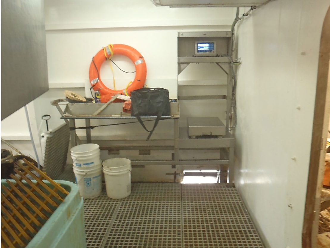
Figure 2-2 Observer sampling station with motion-compensated platform (MCP) scale.