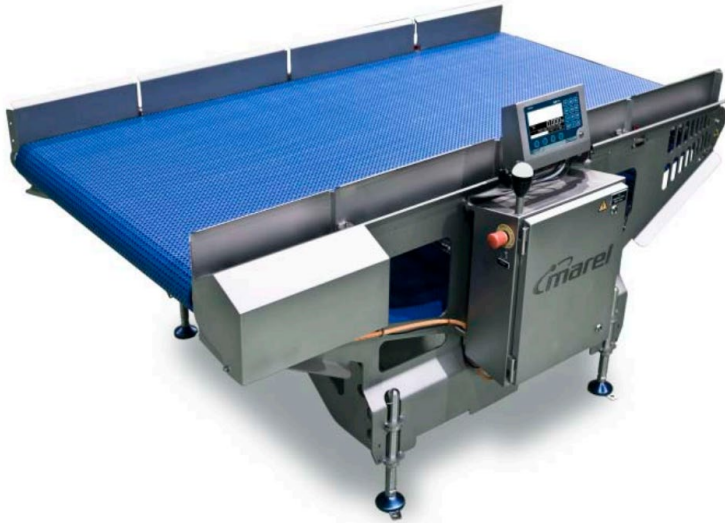
Figure 2-3 Flow scale. This image is for example purposes only and does not represent an endorsement by NMFS.