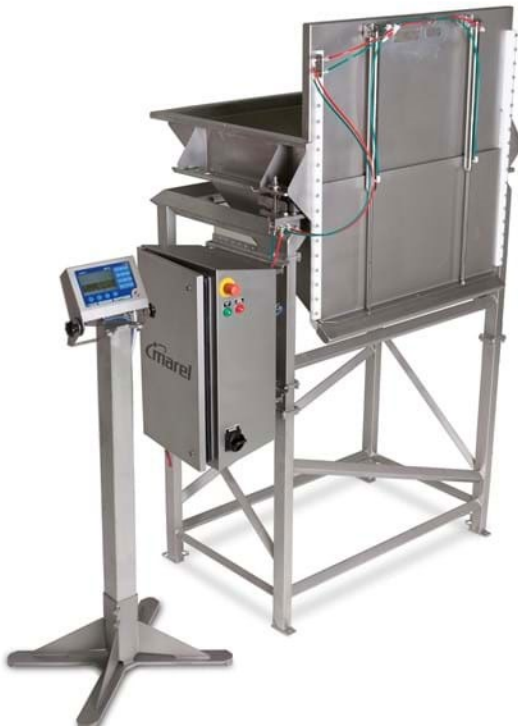
Figure 2-4 Hopper scale. This image is for example purposes only and does not represent an endorsement by NMFS.